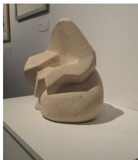
'PRISONER ' another piece in Bath stone and exhibited at the Ironstone Prize exhibition at Banbury Museum, 2020