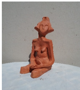
'METAMORPHOSIS ' (1), (2) and (3)